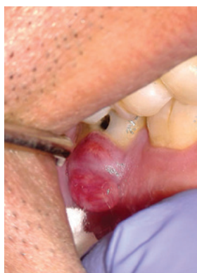
Figure 1: Tooth #31: Necrotic pulp/acute apical abscess, spreading infection

The recommendation for management of soft tissue edema of odontogenic origin includes clinical intervention in the form of incision and drainage. A rapid, sharp incision through the oral mucosa adjacent to the alveolar bone usually is sufficient to help rid the body of toxic purulent material and decompress the tissues. This technique allows better perfusion of blood