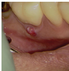
Figure 3: Tooth #30: Necrotic pulp/chronic apical abscess, sinus tract

containing defensive elements and increased oxygenation to the infected area.